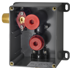
URINAL FLUSH VALVE