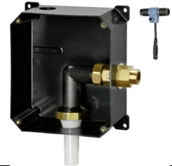
WC FLUSH FITTING