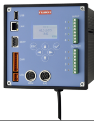
ECC2 FUNCTION CONTROLLER